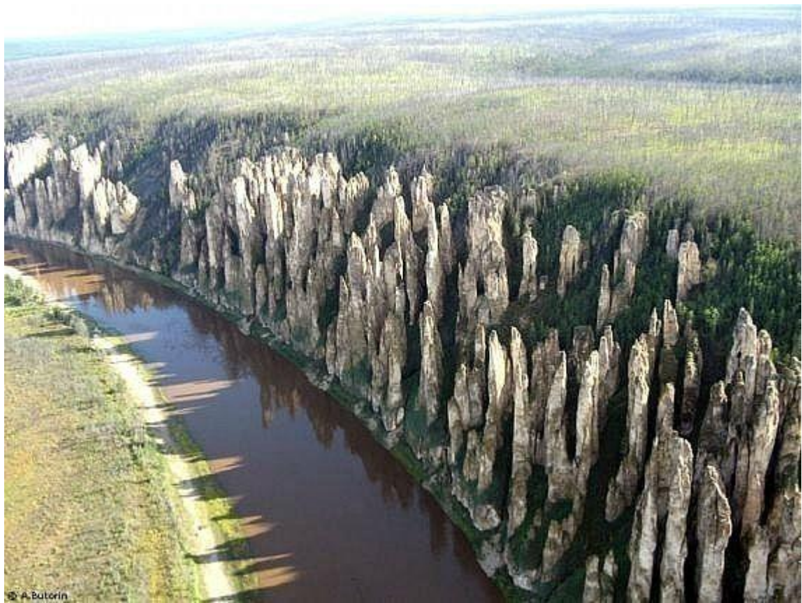
Banpo Bridge in Seoul, South Korea 首爾半波大 橋的彩虹