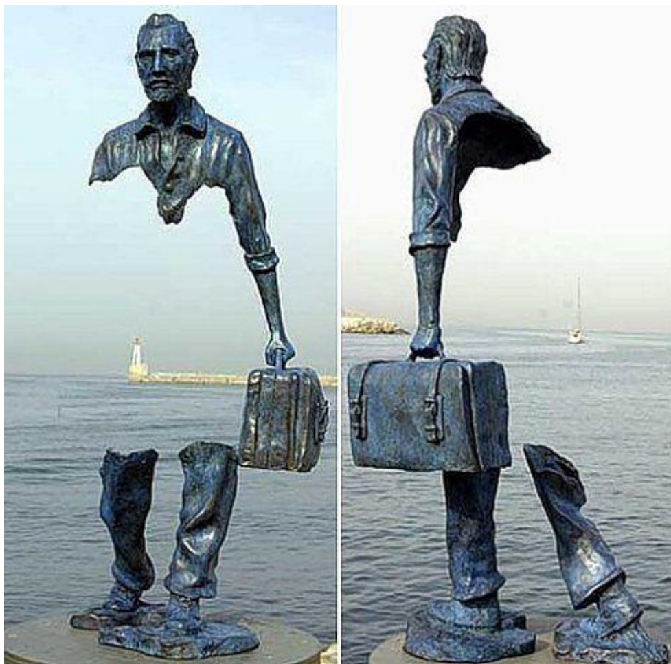
Family photo 全家福