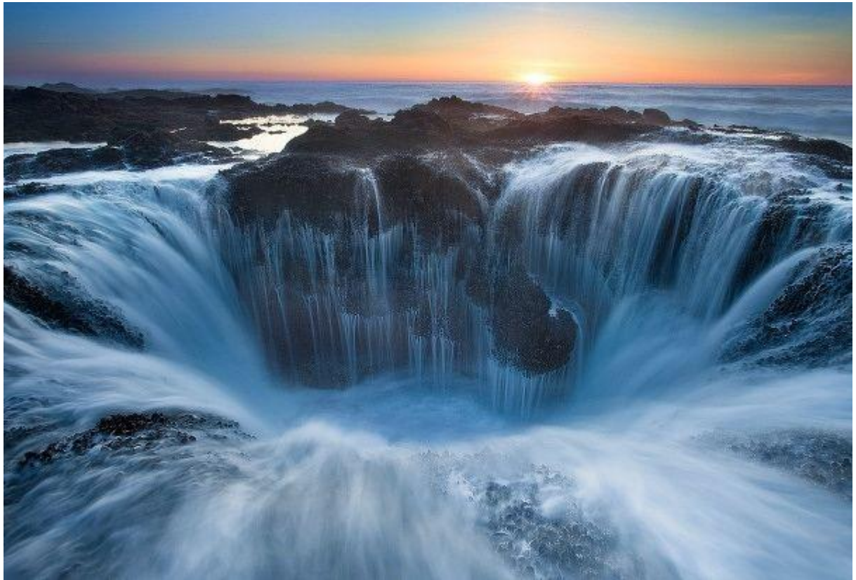
Emerald Lake in the crater of an extinct volcano. Tongariro National Park - New Zealand