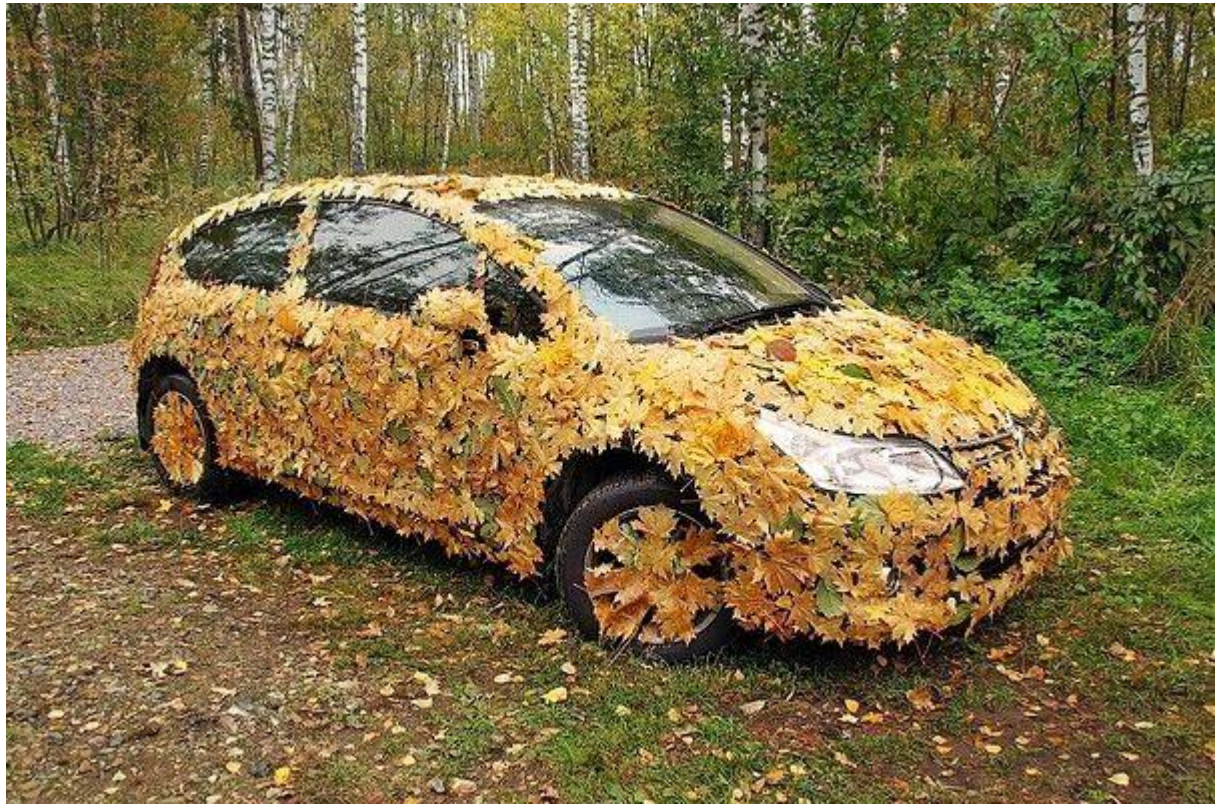
Haus Rizzi - Germany. 別出心裁的德國房子設計