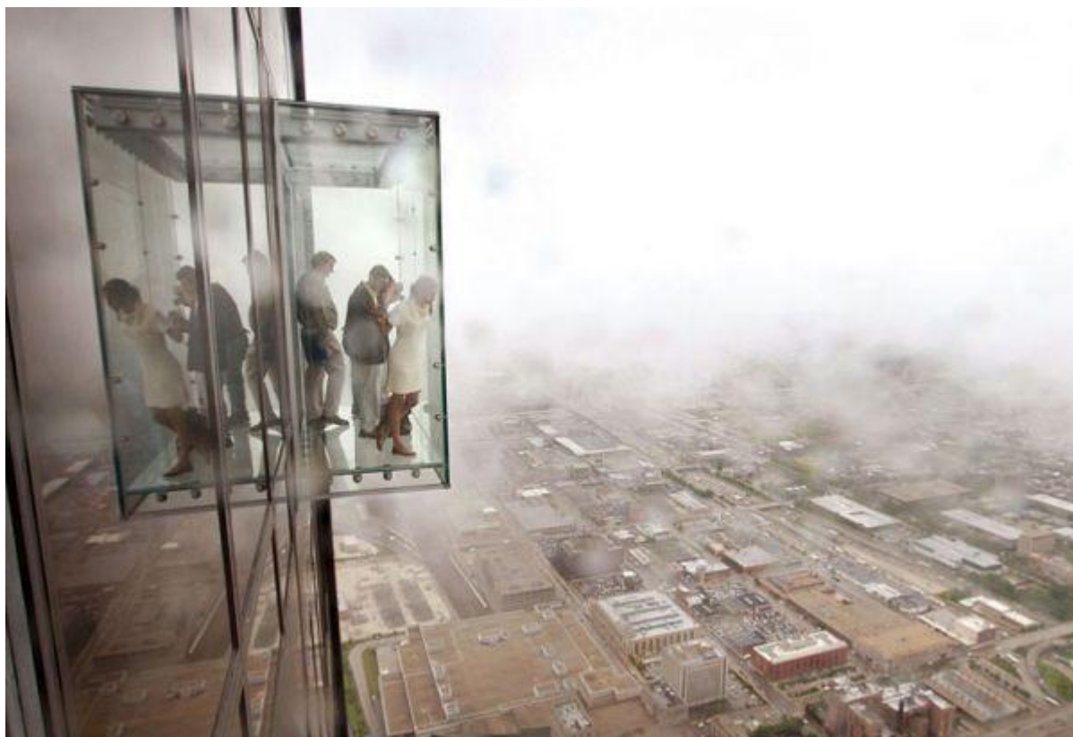
View of the sunset from inside the wave. 浪下 看日落.